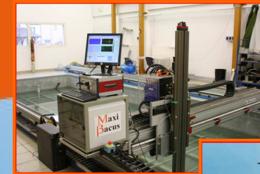
Big-size MAXI BACUS© for industry