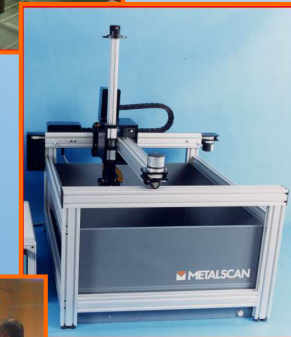
Small size MINI BACUS© for labs