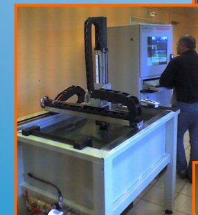
4 axis BACUS©