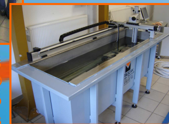
2 axis BACUS© dedicated to long shapes